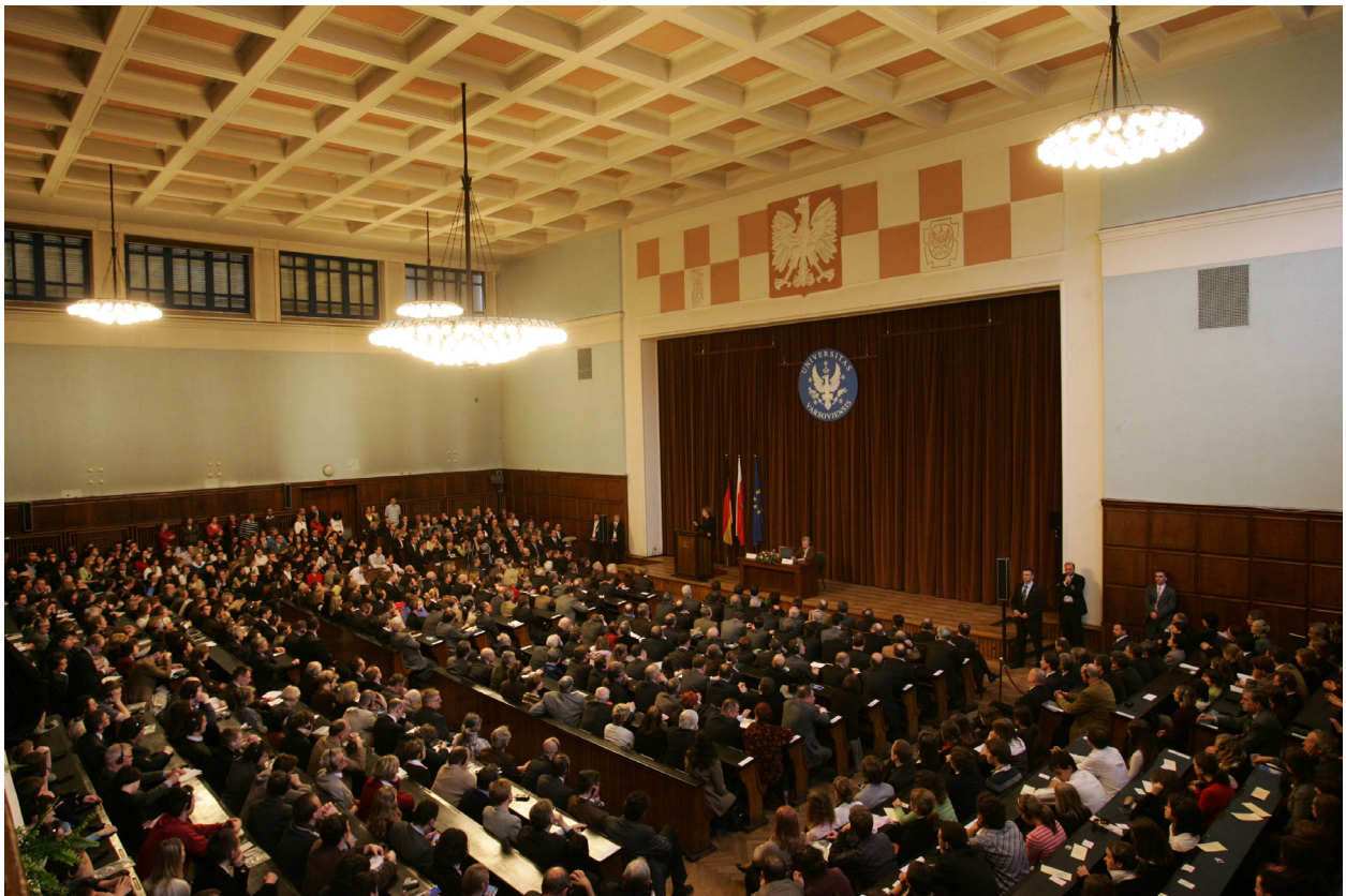
Mickiewicz Hall in Auditorium Maximumum (the meeting with Angela Merkel)