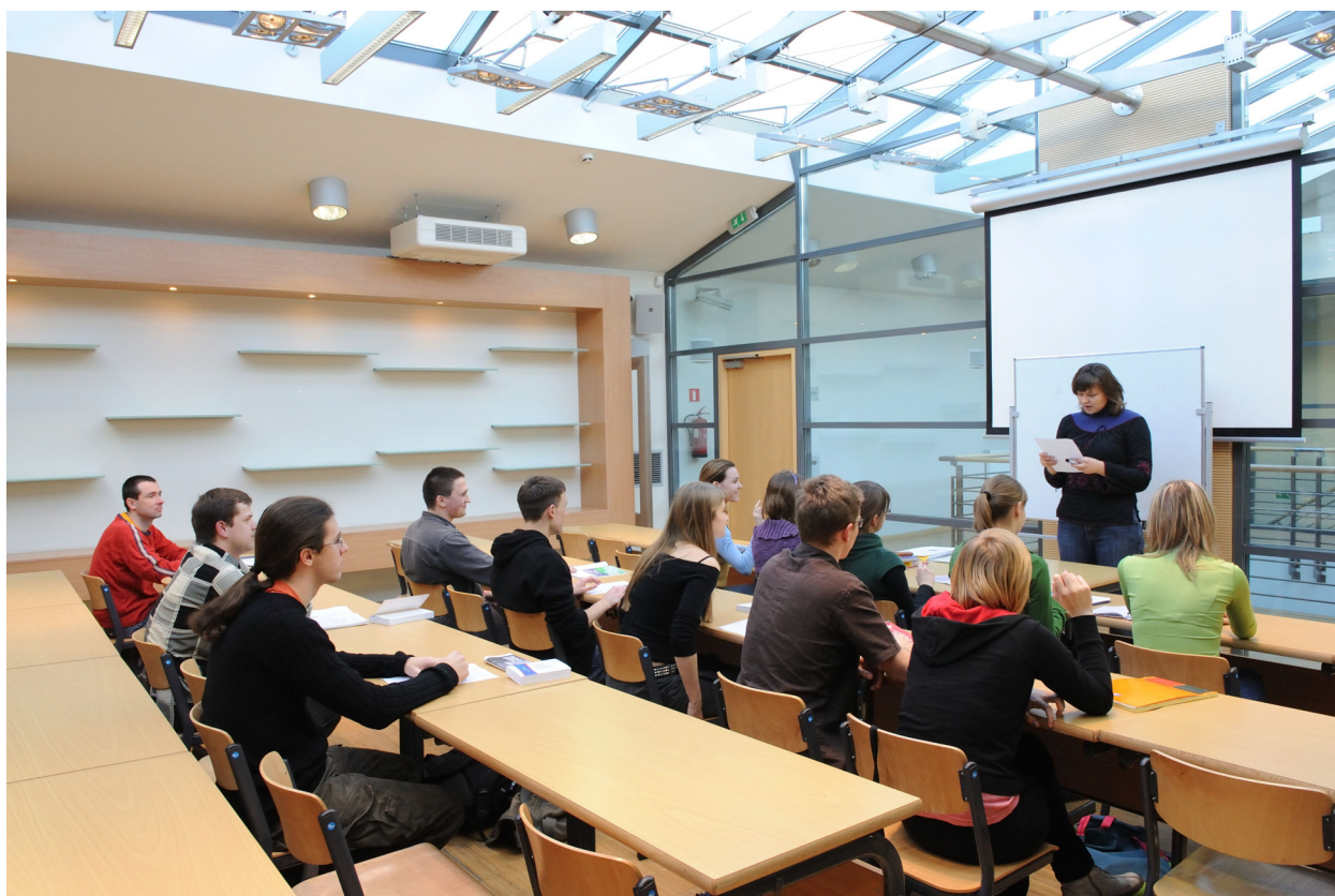
A lecture room in The Old Library Building

More detailed information about the lecture halls and rooms is contained in the table below. All of the rooms and both entire buildings are reserved exclusively for GR20 during the period of 8–12 July, 2013, from 8:00 to 20:00, and all costs, including technical support, will be covered by the University of Warsaw: