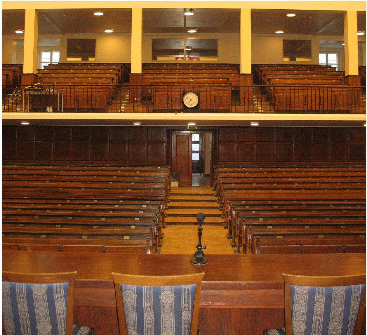
Mickiewicz Hall in Auditorium Maximum, you can see the balcony