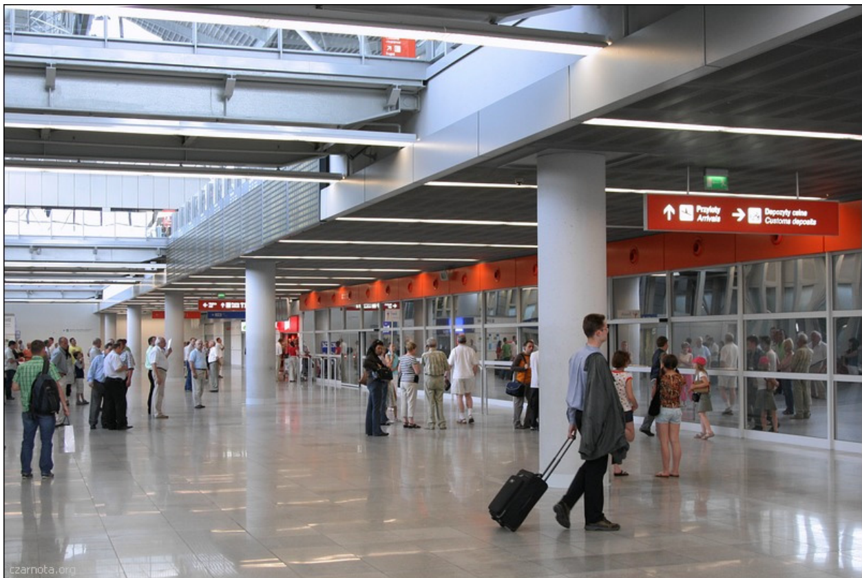
Arrivals at Chopin Airport in Warsaw

Clear and comprehensive travel instructions will be provided to all the participants in advance as well as information about contacting the organizers quickly in case of emergency. On the arrival day at the airport, several organizers will form an information/reception point available for the coming delegates.