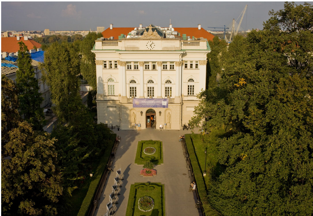
The Old Library Building, the conference venue