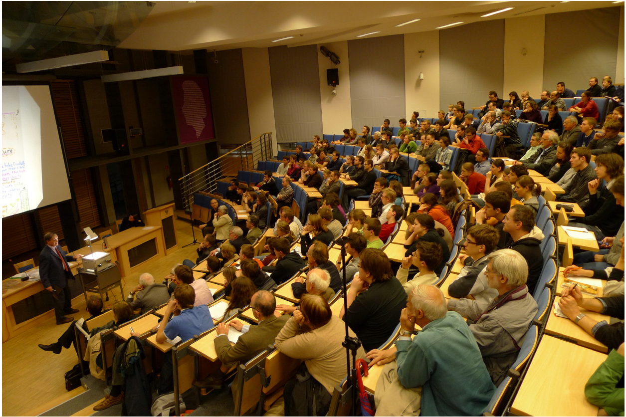
A lecture hall in The Old Library Building (the lecture of Roger Penrose)