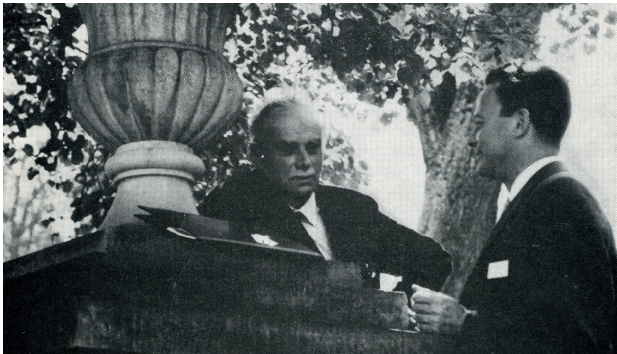
P.A.M. Dirac and R.P. Feynman