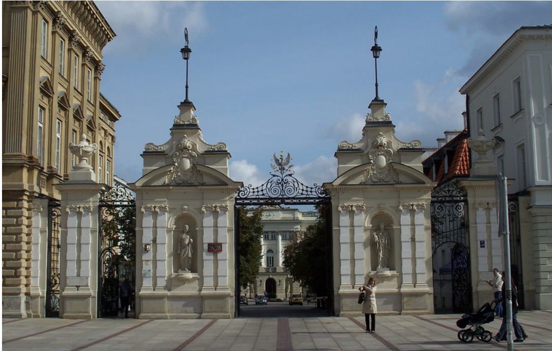
The University Gate; inside: the conference venue