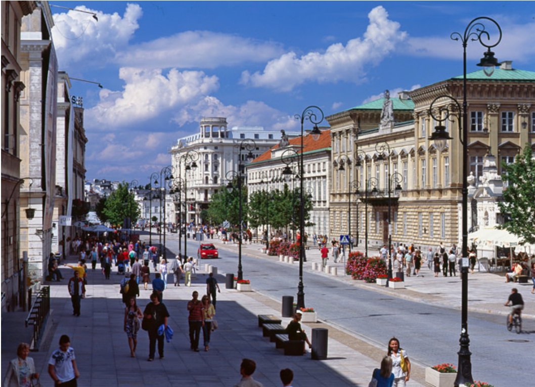
Krakowskie Przedmieście street, the neighbourhood of the conference venue

We propose to organize GR20 to be hosted at the Main Campus of the University of Warsaw in Warsaw, the capital of Poland, during the period of July 8-12, 2013.