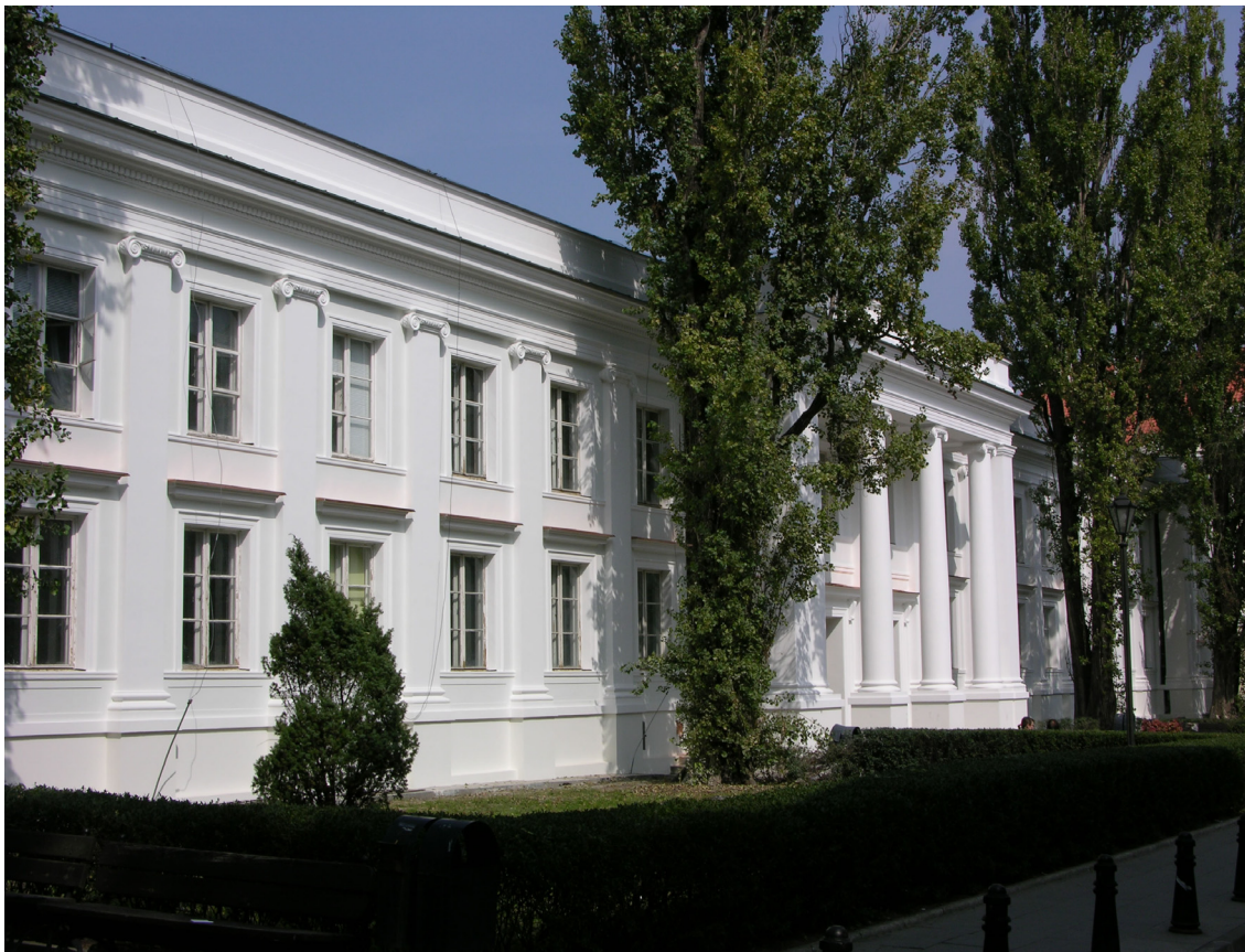
Auditorium Maximum, the conference venue

The buildings are adjusted to meet the needs of people using wheelchairs and are well-equipped with multimedia devices. They create a unique atmosphere and serve as a great place to organize conferences, seminars and other events. All services, including WI-FI, multimedia, a computer room with 24 workstations, translation devices, catering, parking etc. are available and at your service. The professional and dedicated technical support team responds to every request and will assist event organizers at any time.