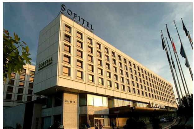
Sofitel Victoria Hotel