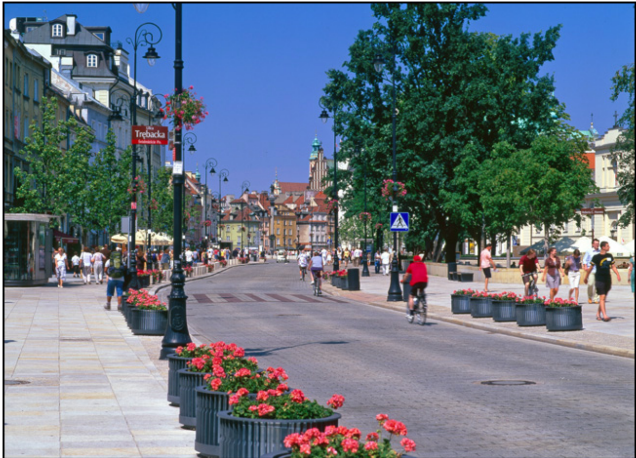
The walk from the conference venue to Ibis hotel

Additionally, all the walks from the hotels to the Main Campus are very pleasant. The surrounding area is particularly nice—the nicest part of the city—and is often visited by tourists, families and anyone who has free time to spend in Warsaw.