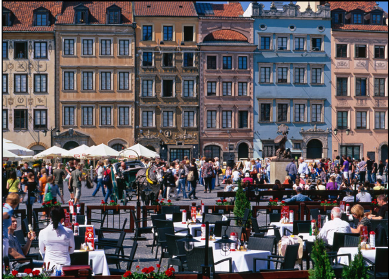
The restaurants at the Old Town Square

Two catering companies have a contract with the university to provide meals for students during term time and for participants of university conferences. Term ends on June 30, just before the planned start of GR20. We will reserve a sufficiently large hall and use it to extend the lunch area. There are also very many small and large restaurants around the University where students and employees eat lunch during the terms. During vacation time they are also very convenient and the service is efficient. Therefore, upon registration, we can offer every participant a choice between the conference lunch and the restaurants. Prices for lunch in Warsaw range from 3€ to 7€.