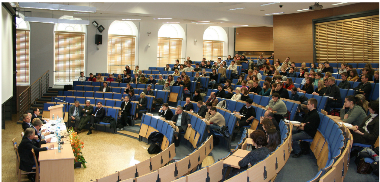
A lecture hall in The Old Library Building