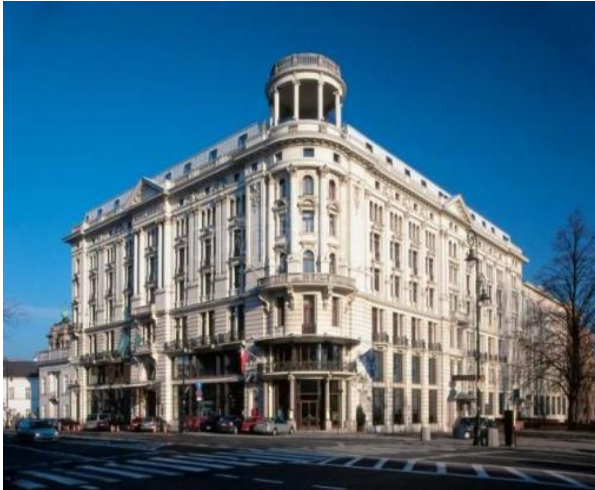
Le Méridien Bristol Hotel

Warsaw and the University of Warsaw offer a wide range of accommodation. In the neighborhood of the Main Campus (and the conference lecture halls), there are numerous economy class hotels ( Harena 2 minute walk, Gromada 5 minute walk, Ibis 20 minute walk or 5 minutes by bus), including the university hotels ( Hera 6 bus stops or a pleasant 30 minute walk), as well as many luxury hotels ( Sofitel Warsaw Victoria 3 minute walk, Le Méridien Bristol 3 minute walk, Sheraton 15 minute walk or 4 minutes by bus). Therefore a sufficient set of hotels is available in all categories, within 2–30 minutes' walking distance from the conference lecture halls.